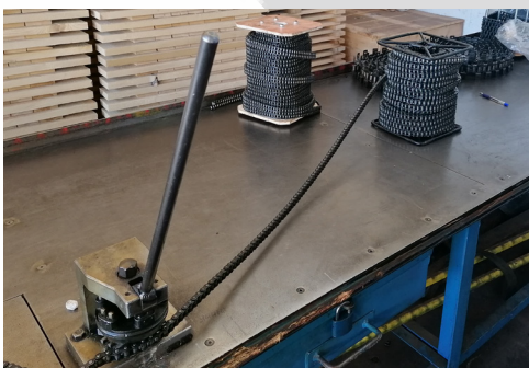
Too much tensed chain