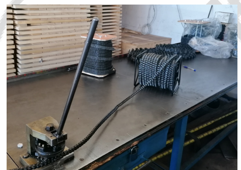
Bad position of reel causes twisting the chain